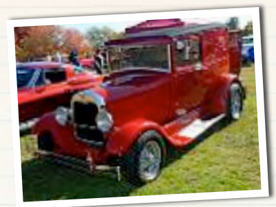
FAMILY PIG ROAST & CLASSIC CAR SHOW